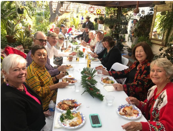
At the December holiday party

Happy New Year! Here's hoping that 2019 proves to be a year of great happiness and prosperity for every member of SDBS and loved ones. The new year also brings a change with a new slate of officers and board members. Some of us are serving in a new capacity, while others are continuing to serve in their present positions. Speaking of changes, being the new president of SDBS is quite a change for me. I've been a member